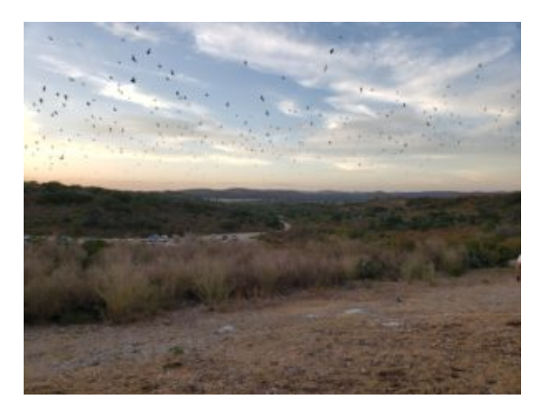
Mexican Free tail bats emerging from Frio Cave