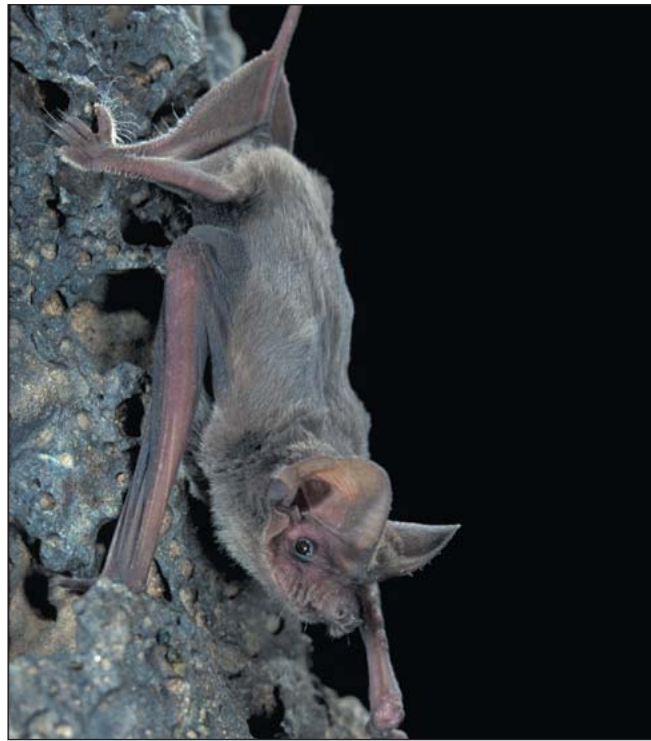
Figure 1. The Brazilian free-tailed bat ( Tadarida brasiliensis ).

The unit for our analysis is the individual female bat, because relatively few males roost in these large maternity colonies. Because damage to the crop occurs in the larval stage of H zea , our goal was to estimate the number of larvae “prevented” from reaching maturity by the presence of a single bat. The overall impact on agriculture is estimated by scaling up our population estimates of bat colonies in the study area. The model we develop is a